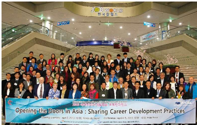
2013 - Seoul, Korea Opening the Doors in Asia – Sharing Career Development Practices

What has APCDA meant to you? Please let us know how you have benefited from APCDA. Send your testimonial to info@AsiaPacificCDA.org . We will post it on our Member Recognition page. If we don't already have your photo, please include a photo in the email.